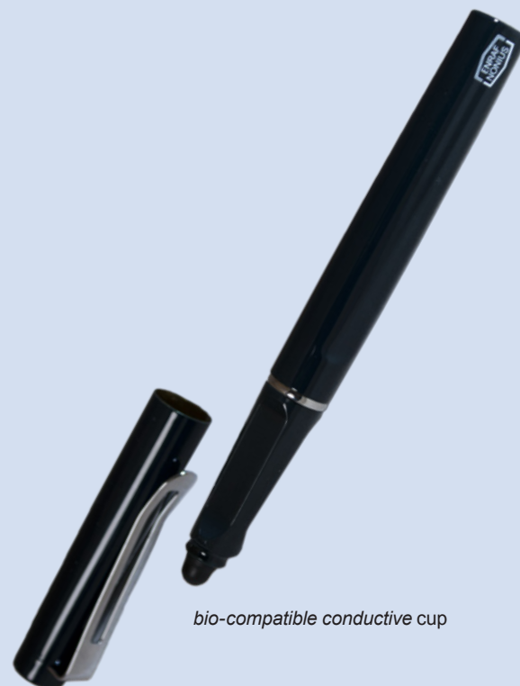
bio-compatible conductive cup